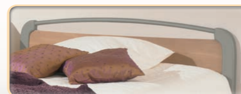
Auzence II board, available in 140 and 160 cm.