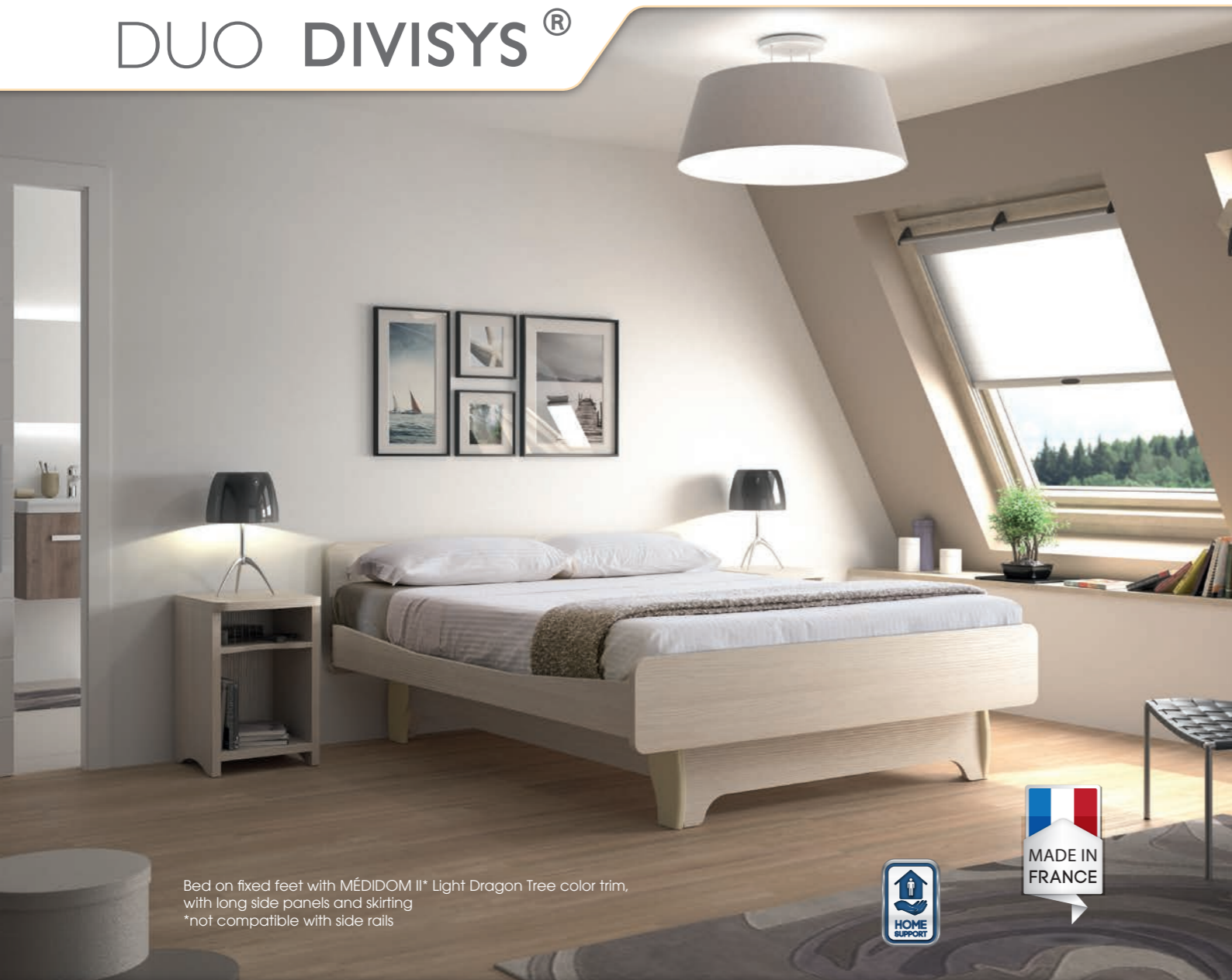
Bed on fixed feet with MÉDIDOM II* Light Dragon Tree color trim, with long side panels and skirting *not compatible with side rails