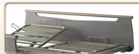
Abélia II board, available in 140 and 160 cm.

Bed on fixed feet with MÉDIDOM II* Grey Dragon Tree color trim, with long side panels and skirting. *incompatible with rails.